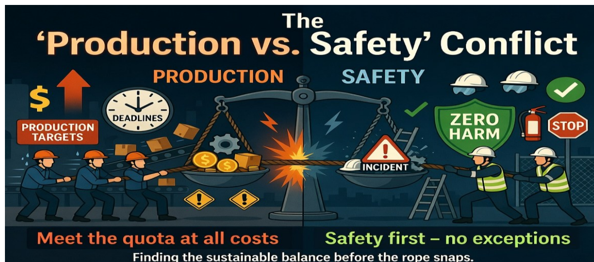
Fig. 2: Impact of Management Participation on Safety Metrics

slowing efficiency (Hirsch, 2026). This leads to a hazardous subculture in which ignoring a mechanical glitch or disregarding safety interlocks to continue the assembly line is an acceptable behavior when incentivization of production targets becomes the priority (Brayne, Lageson & Levy, 2023).